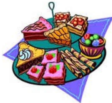
Bring a dessert for the dessert contest... Or just one to share!